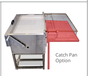
Catch Pan Option