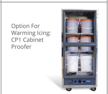
Option For Warming Icing: CP1 Cabinet Proofer