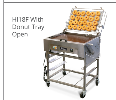
HI18F With Donut Tray Open