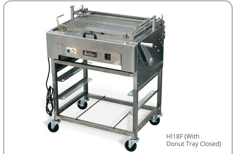
HI18F (With Donut Tray Closed)