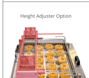
Height Adjuster Option