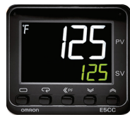
Electronic Temperature Controller