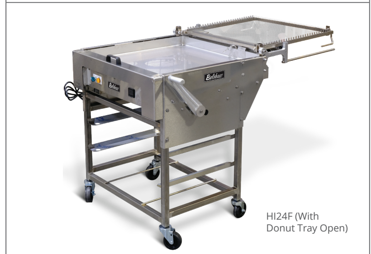
HI24F (With Donut Tray Open)